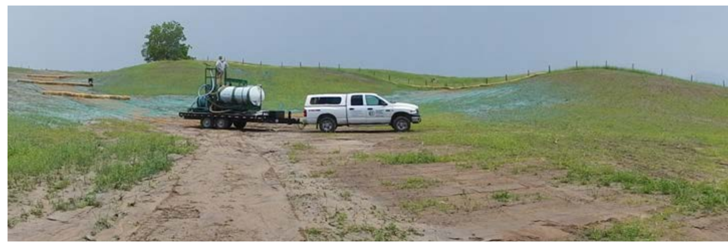
Figure 1: A truck towing a slurry of seed, ProGanics, Fertilizer and Tackifier (erosion control product) and a worker hydraulically applying over the finished grade of a legacy site.

Applying a soil amendment creates a better environment for plant roots by improving the soil organic matter and structure. A healthy soil with good porosity and permeability can help provide optimal growing conditions for plant roots while aiding in erosion control. Creating and maintaining these "healthy soils" play a key part in ensuring MAAP project sites are a long-term success. An application of a soil amendment to marginal soils can quickly jump-start the naturalization process by implementing erosion control protection to lock down seeds, introducing microbes into the existing soils and boosting the nutrient cycling processes. The soil amendment including seed, fertilizer and erosion control stabilizers can all be put in one slurry and applied hydraulically typically in one day at a legacy site (See Figure 1).