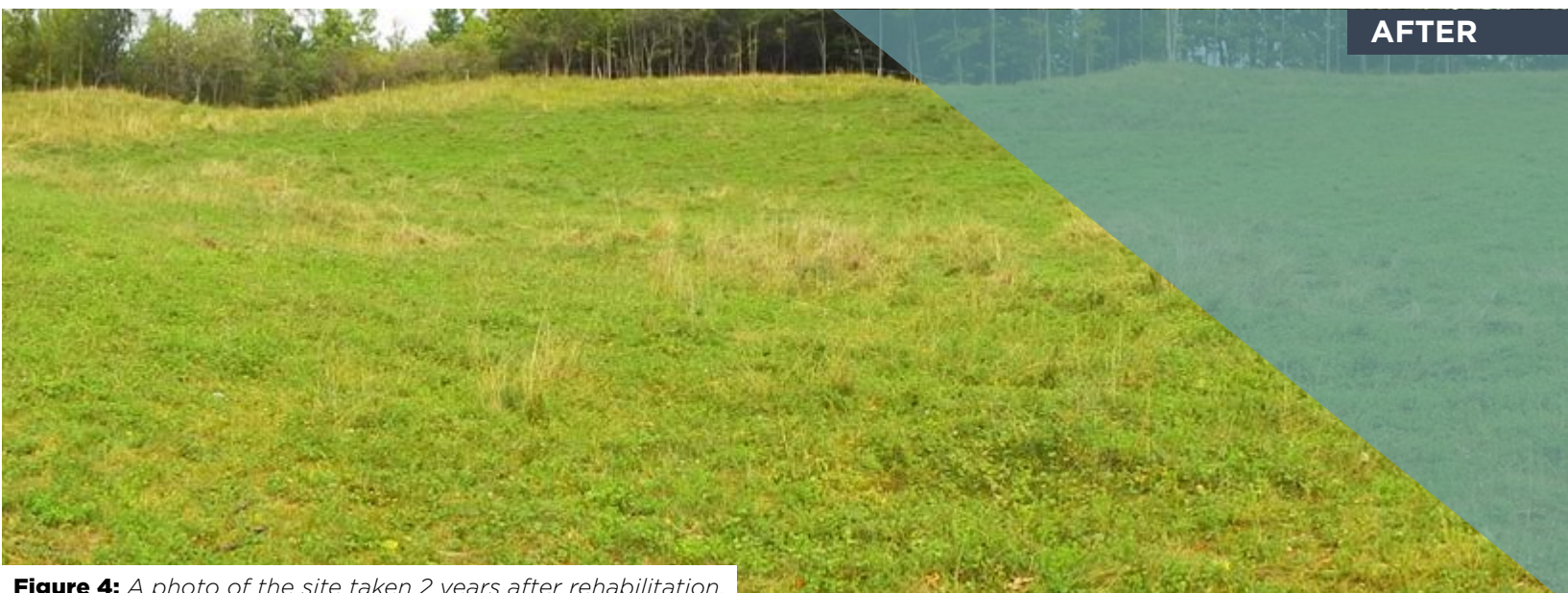
Figure 4: A photo of the site taken 2 years after rehabilitation.