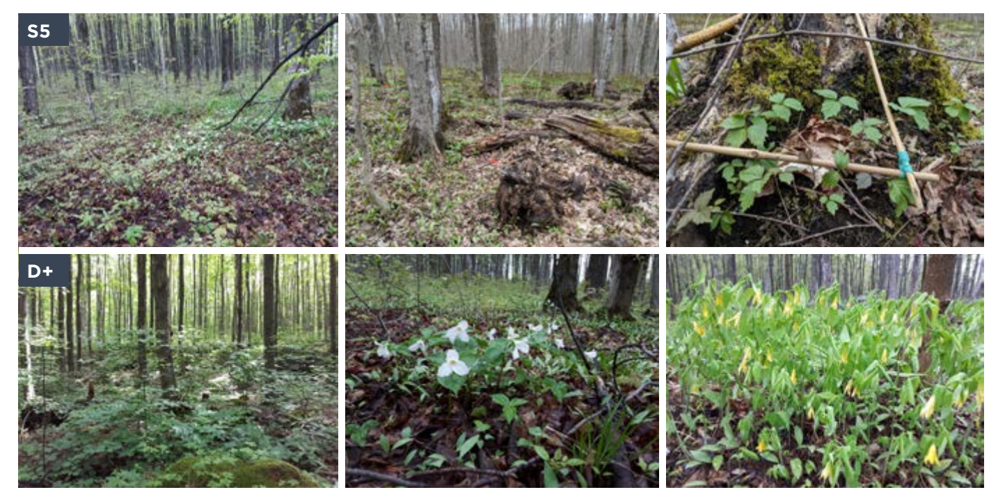
Figure 4: Not-treated (NT) areas (top) and LM-treated blocks (middle, with example close-up image of a community sample in right panel) in S5; images of D+, for comparison (not treated).