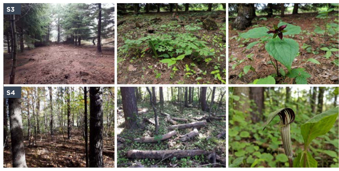
Figure 3: Not-treated (NT) areas (top) and LM-treated blocks (middle, with example close-up image of a community sample in right panel) in S3 and S4 recipient seres.