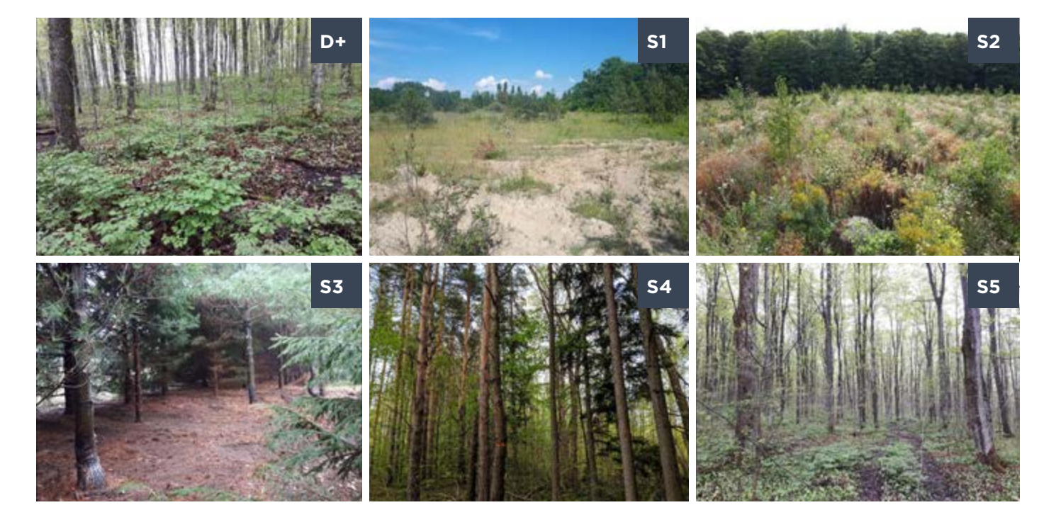
Figure 1: Donor forest (D+) and recipient seres (S1-S5) incorporated in the living mulch translocation experiment (Duntroon, ON, Canada)

In total, 30, 125m<sup>2</sup> of LM recipient blocks were installed from 2016-2017 and operators distributed the LM from D+ to recipient blocks at S1-S5 to depths of 30-45cm. Biodiversity found within LM can be extremely sensitive to physical disturbances. To mitigate this risk, operators carried out translocations after most organisms entered winter dormancy (e.g. November) and completed redistribution within 12 hours of extraction.