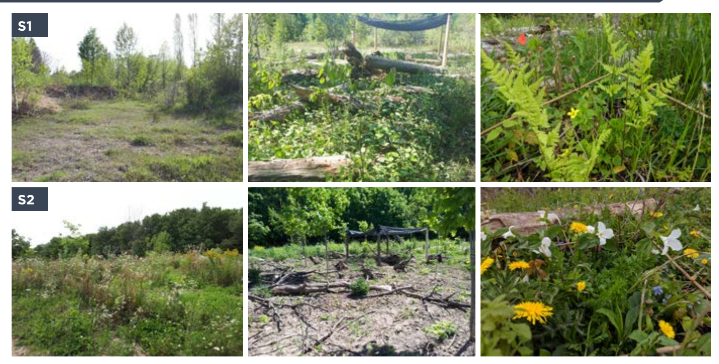
Figure 2: Not-treated (NT) areas (top) and LM-treated blocks (middle, with example close-up image of a community sample in right panel) in S1 and S2 recipient seres.

Find the full interim report with statistical information on our website at www.toarc.com!