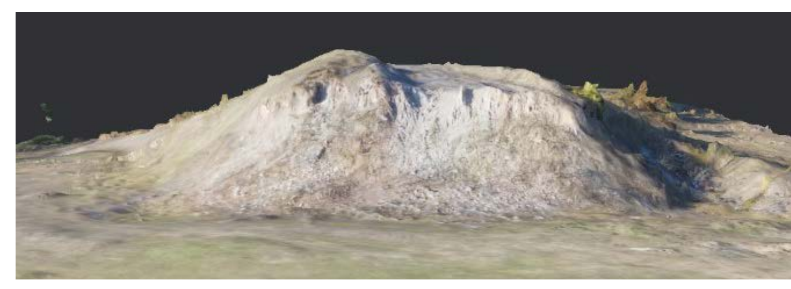
Figure 3: A screenshot of the 3D rendering from our drone data of the same pit face in Figure 1.