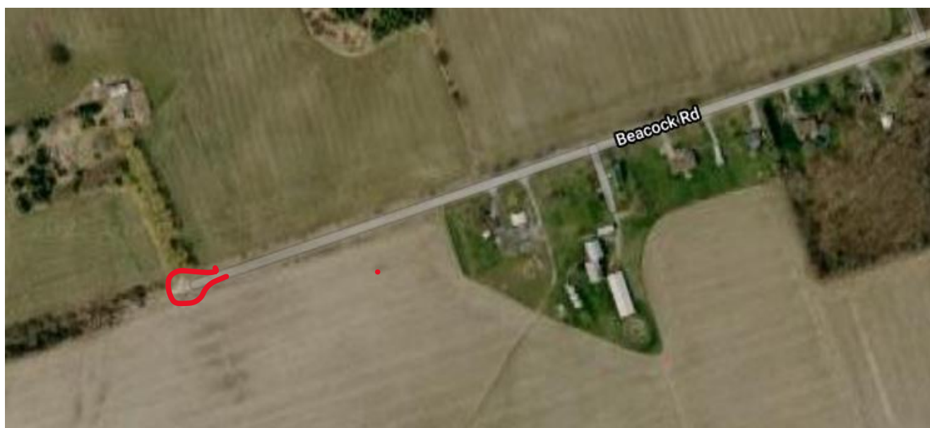
Figure 2: Proposed Location of Beacock Road Turnaround