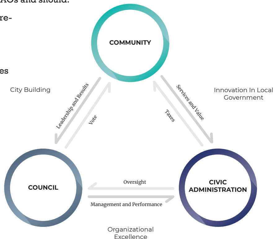
Fig.1. City Council, the community and city administration all play a role in creating effective local government.

Most Mayors and Councillors will have little or no experience with CAO recruitment processes. For a new CAO, the initial stage of employment is a critical time to develop an understanding with Council as to expectations and commitments.