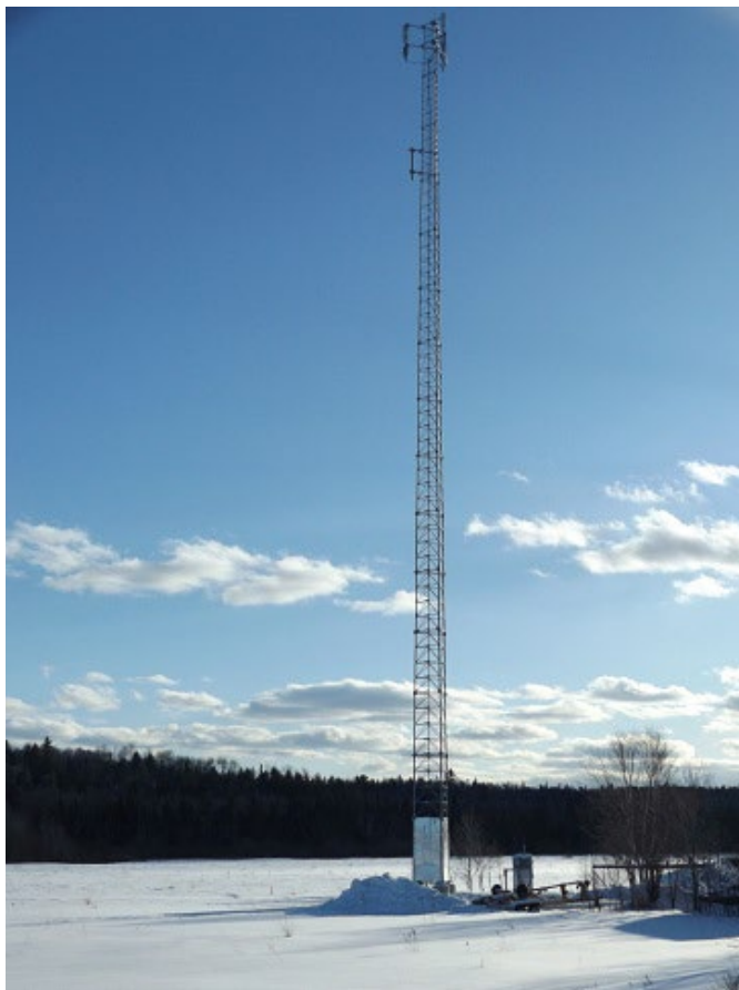
Figure 3 –Tower Elevation

The proposed installation provides an opportunity to accommodate future technologies as well as potential co-location with other licensed carriers, thus limiting the number of new tower structures required in the area.