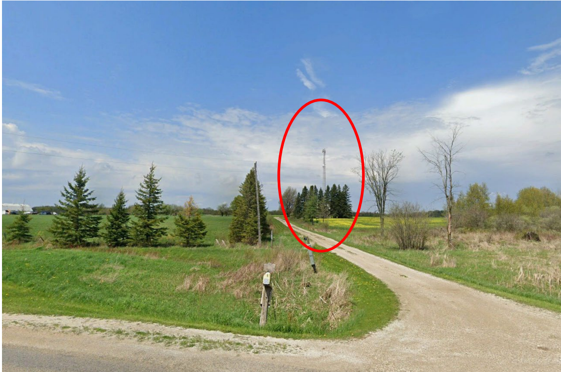
Above: Photosim of the proposed tower before and after– looking north on Southgate Road 24