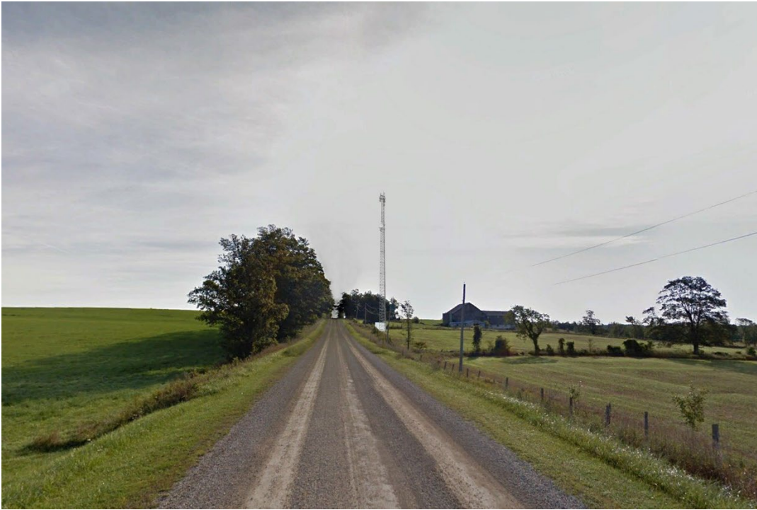
Above: Photosim of the proposed tower before and after– looking east on Southgate Road 22