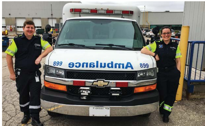
Paramedics are on the frontlines providing life-saving services including emergency and non-emergency pre-hospital care to residents.

When the time comes, municipalities will also be ready to lead Canada's recovery, along with our federal partners. Local leaders are already delivering frontline results for Canadians. And they are exceptionally well-placed to deliver stimulus funding quickly—to create jobs and get the economy going. Deepening the federal-municipal partnership even further will help Canada thrive and prosper once again.